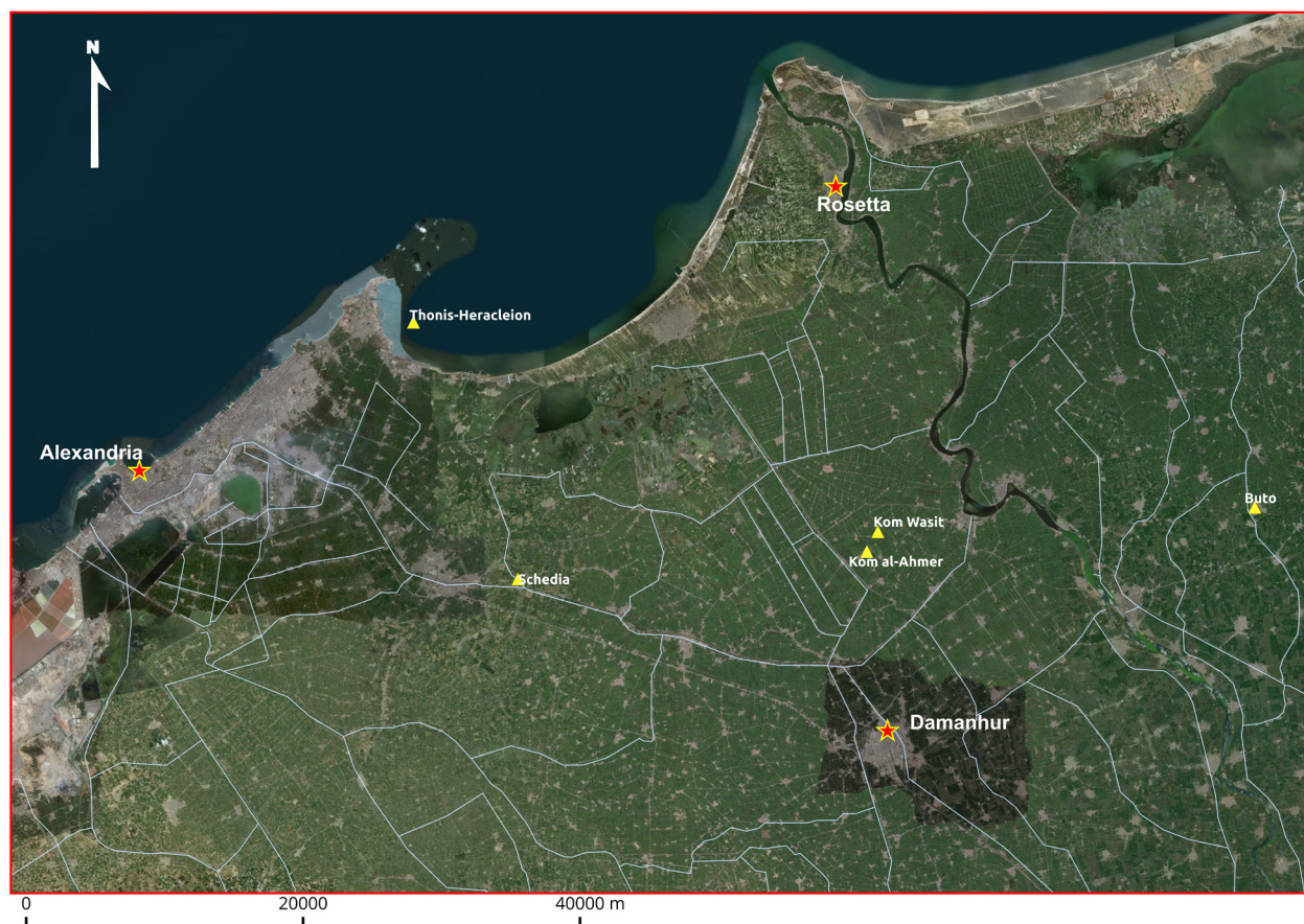
Figure i: Kom al-Ahmer and Kom Wasit in their regional context (Background Images Esri and OpenStreetMap).

The coin finds from Kom al-Ahmer and Kom Wasit provide valuable data for the circulation of coins in the region from the Early Ptolemaic to Late Roman and Byzantine periods. Over 1,400 coins have been collected during excavations, of which approximately 1,070 are presented and discussed in this volume. This large volume of coins, together with