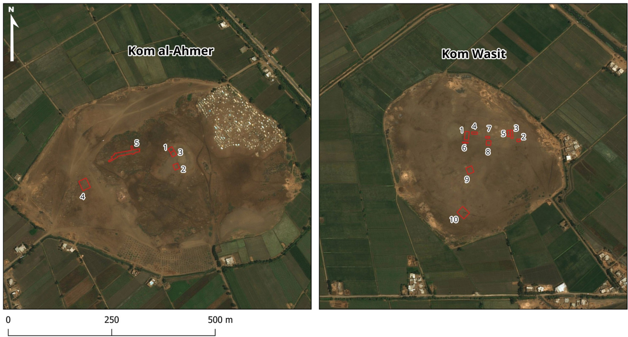
Figure ii: Kom al-Ahmer and Kom Wasit, location of the excavated units.