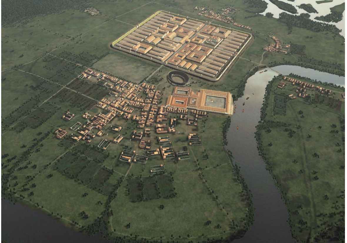
1. Reconstruction of the fortress of Isca at Caerleon, c. AD 120

Adluniad o gaer Isca yng Nghaerllion, c. 120 OC