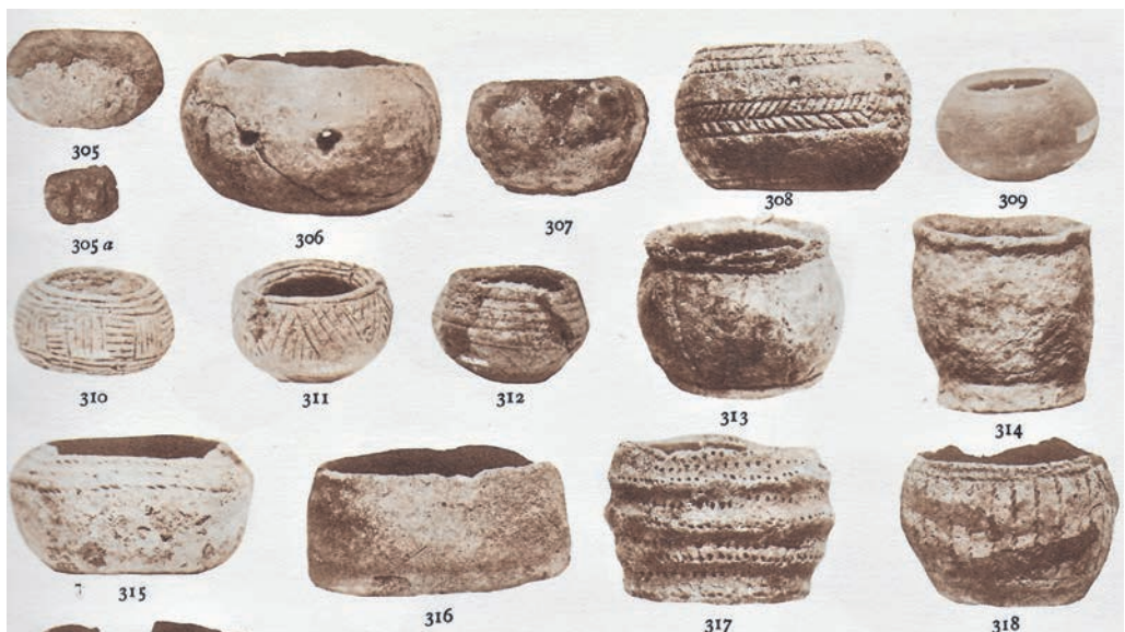
Figure 1.3 Abercromby's photographic illustration of cups. From Abercromby, 1912, Vol.II, Plate LXXXIII.