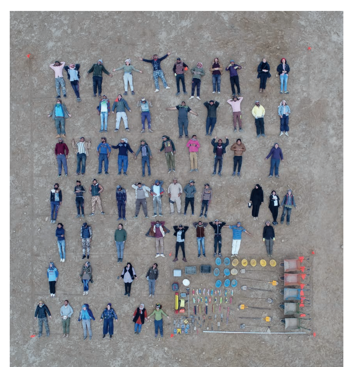
Figure 1.14 The 2019 team at Tello

It is essential that the project has a dedicated house staff. At minimum this should consist of a cook and a housekeeper. It is not reasonable or efficient to ask the professional team members to take turns cooking. They are exhausted from being in the field, and it takes them away from the proper work which they need to do in the dig house – and they may not know how to cook! Similarly, the project needs a housekeeper to keep the house clean and tidy and to do the laundry – laying these tasks on the professional staff will again only result in detracting them from their proper work, and ensure that these tasks are not properly done. Depending on the size of the expedition, both the cook and the housekeeper may need one or more assistants.