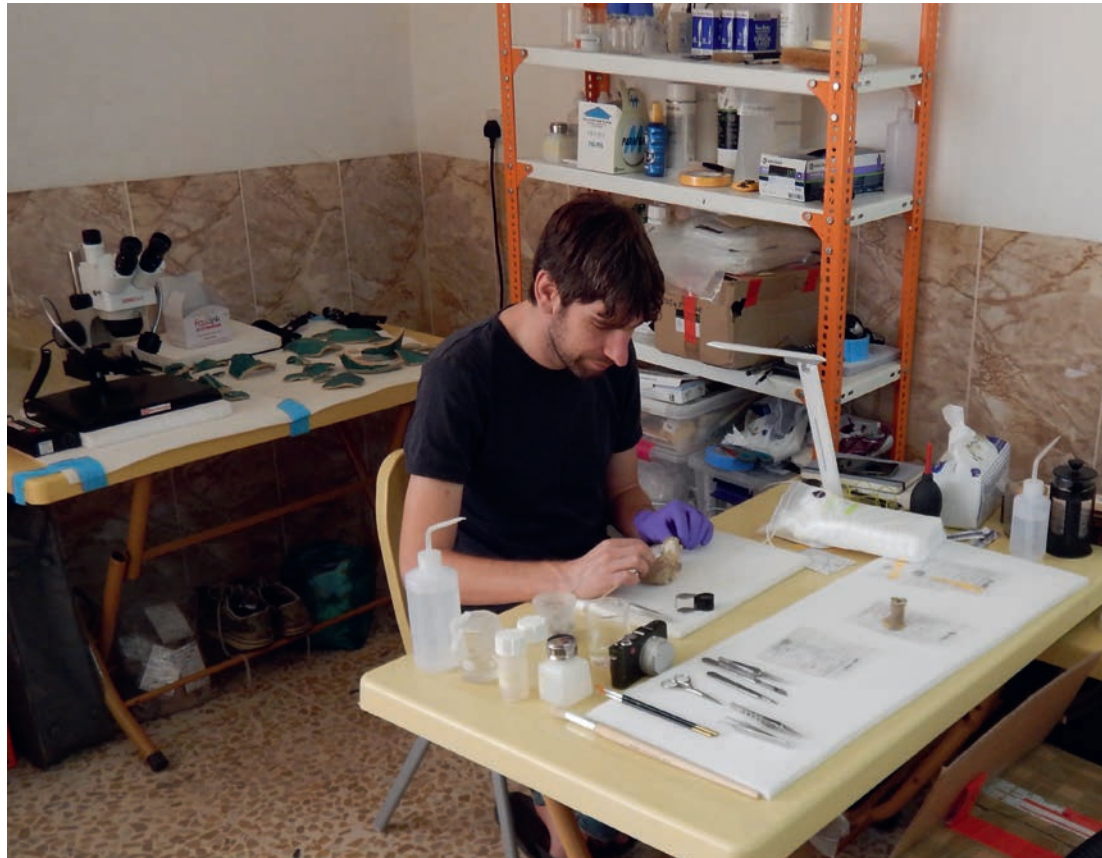
Figure 1.6 A well-equipped conservation studio is essential for the proper treatment of small finds

Every excavation should have a trained professional conservator. The tasks will include lifting fragile objects on -site, stabilising them in the laboratory, ensuring that they are ready to be handled by the photographer and illustrator, restoring them, preparing them for transport to a museum or storage magazine, and preparing them for museum display. To achieve all of this, the conservator will need to advise on and co-operate in the creation of a conservation field laboratory equipped with the appropriate equipment and chemicals. Depending on the size of the operation, or the particular requirements (such as removing wall paintings), more than one conservator may be required.