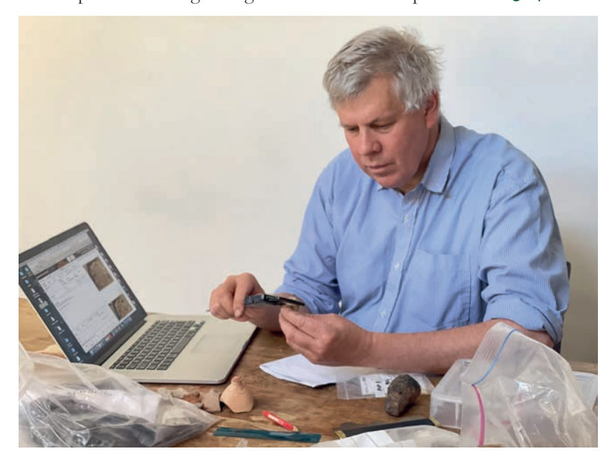
Figure 1.4 The systematic registration of finds, contexts and other data lays the foundations for the process of research and writing up

Excavations generate huge amounts of ceramics. Keeping on top of this is a massive task. The job of the ceramicist entails supervising the material coming in from the field and processing it, from washing and initial sorting through to recording and successive levels of analysis — examining production methods, establishing typologies, working out dating and function, and so on. The ceramicist needs to be in constant dialogue with the director and archaeologists on-