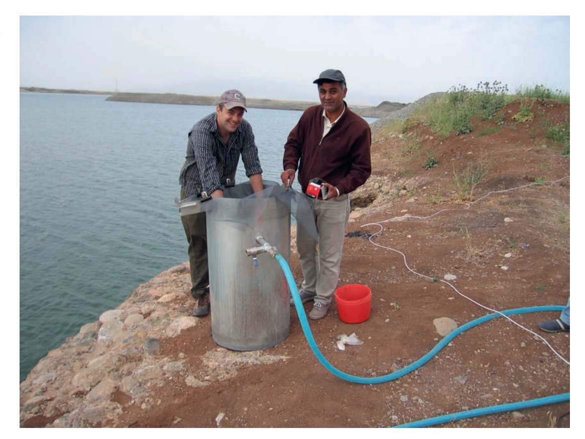
Figure 1.9 Flotation of soils samples is used to recover archaeobotanic remains (the 'light fraction'), as well as microdebris of other materials such as ceramics and stone ('the heavy fraction')

both a sampling strategy and a procedure for flotation. To achieve this, a trained archaeobotanist is needed to design and implement the programme of flotation for recovering archaeobotanical remains and study the material recovered. Whether the archaeobotanist needs to be present on site for the full length of the excavation season will depend on the volume of material generated, and also on whether or not it is possible to study the material in a laboratory elsewhere. See further details in the section on environmental sampling below.