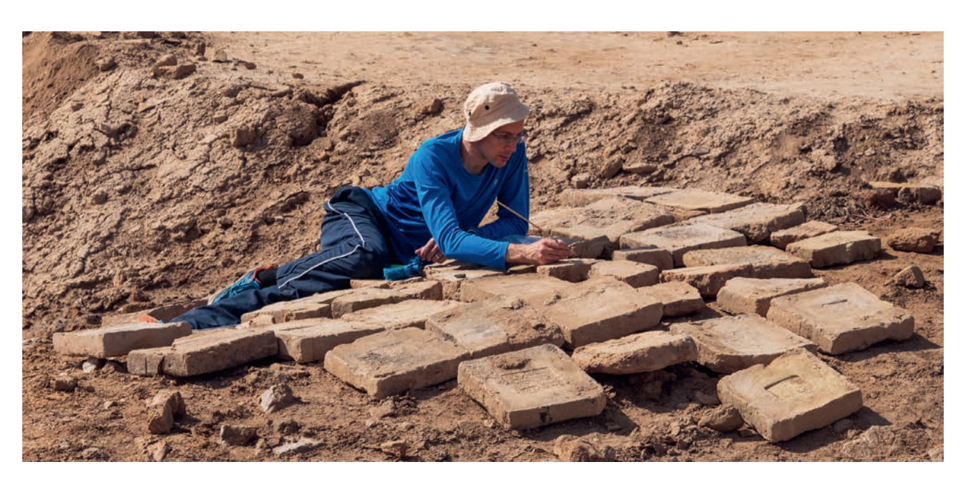
▲ Figure 1.12 Epigraphist working on bricks inscribed in cuneiform writing