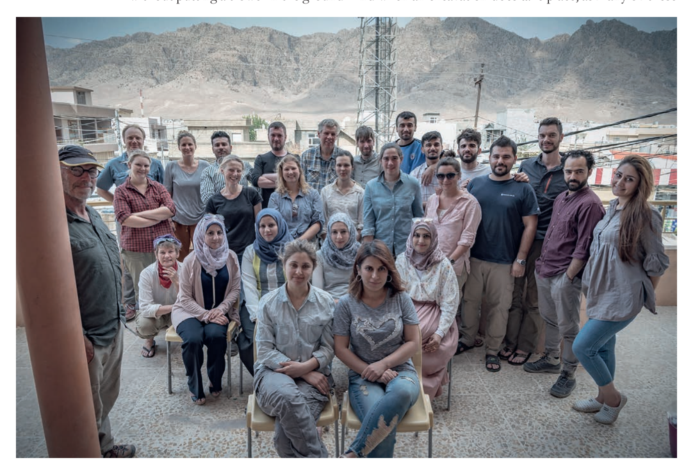
Figure 1.1 The Season 4 team in Rania

Initiating an archaeological field project is an exciting, yet challenging, prospect for an archaeologist. Our job is the recovery, preservation and interpretation of the past through its material remains, and the contribution from field projects has been, and continues to be, immense. Of course, excavation is one part of this – but it is only one part. This has always been true. In the case of Iraq, the earliest excavations were accompanied, and indeed preceded, by evaluation of written sources and mapping projects. The range of methods now available to modern archaeologists is very extensive – study of documentary sources, regional and topographical survey, remote sensing through overhead imagery and geophysical prospection, surface collection and, finally, excavation. These methods go hand in hand. It will be evident that a huge amount can be learnt without putting a trowel in the ground. And when an excavation does take place, as many of these