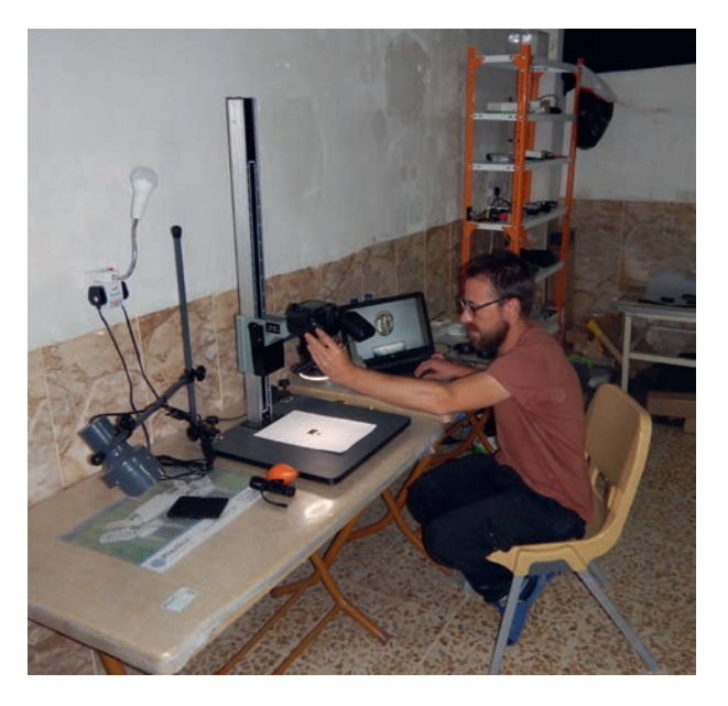
Figure 1.7 Every small find needs to be photographed

The photographic archive is a core part of the excavation record. On any project with a significant volume of finds, the project needs the skills of a dedicated photographer to create a full photographic record of the small finds and key ceramics. In the case of large-scale projects this will often be a full-time member of staff. Additionally, while day-to-day photographs of the excavation in progress can be taken by the excavators, having a professional photographer to take final photographs of the excavations for publication can be hugely beneficial.