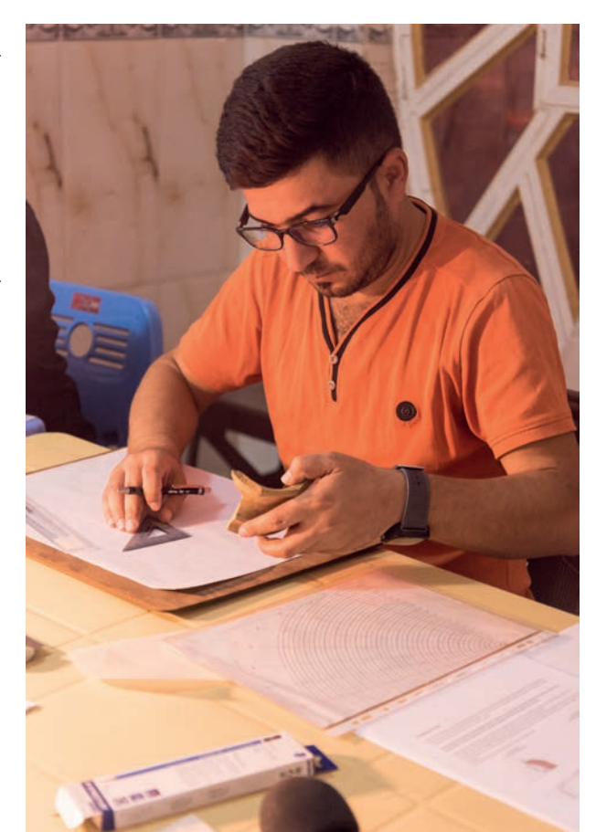
Figure 1.8 Illustrator at work on a ceramic drawing which will in due course be digitised for publication

Archaeobotanical remains constitute a highly important element of the material generated by excavations. There will be very few sites which, properly managed, do not yield significant archaeobotanic data. Every site needs a protocol for archaeobotanical recovery, including