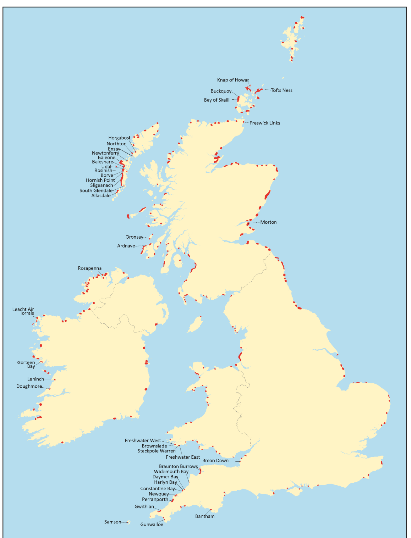
Figure 2. Coastal sand dunes in the British Isles, shown in red.

The sites which include molluscs in palaeoenvironmental analyses are named. (modified from Doody 2008, 2009).