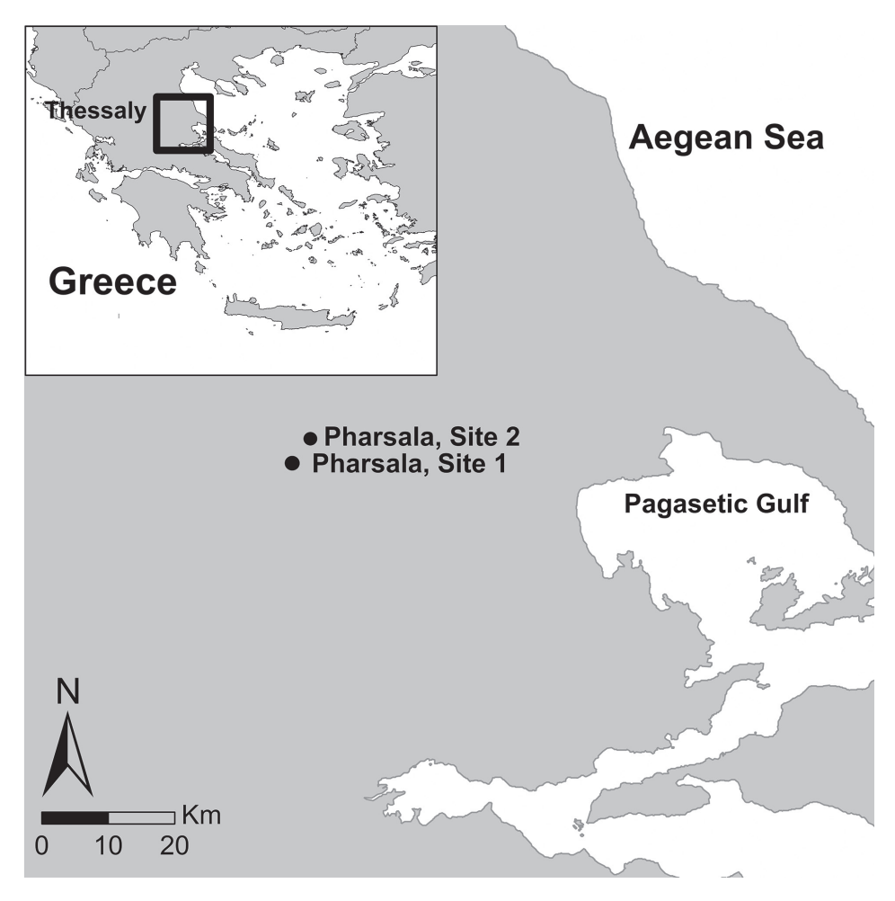
Figure 1. Map of Thessaly (created by R. Bronkhorst).

burial grounds with 6 km distance between them, dating to the Protogeometric period (1100-850 BC). From this point onwards, these two burial grounds will be referred to as Site 1 and Site 2. Site 1 is located at the western side of the modern town. It includes a tumulus, which will be called Site 1-tumulus and an open area to the east of this tumulus with 35 more graves, which will be called Site 1-cemetery. Site 2 is located to the northeast of Site 1 and includes only two tombs.<sup>7</sup>