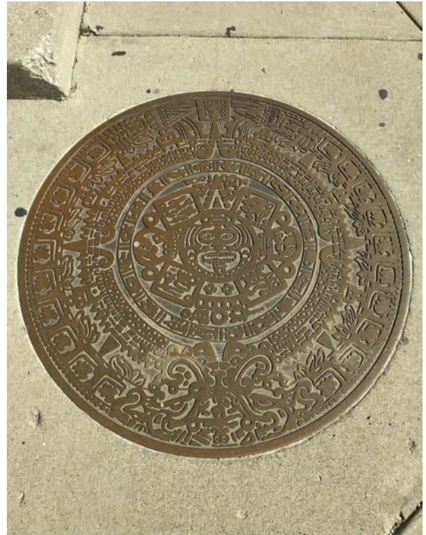
Figure 1.4. Manhole cover, depicting the Aztec Sun Stone in the Pilsen neighborhood of Chicago.

The sense of unity, rooted either in spatial and/or social commonalities, is the most powerful force to trigger collective action and solidarity. There is a reflexive relation between collective identity and collective action (Carballo et al. 2014). The formation and maintenance of collective identities allow and inspire the group members to engage in collective actions, and these collective actions are generative forces during the establishment and reinforcement of collective entity as well as of individual group membership (Calhoun 1991). Throughout history, major, labor-intensive construction projects are frequently spectacular manifestations of resource mobilization strategies to achieve a shared goal and collective experiences as well as to build and sustain community identities. These collective projects, such as the above-mentioned construction of early Christian churches across the Hungarian Kingdom,