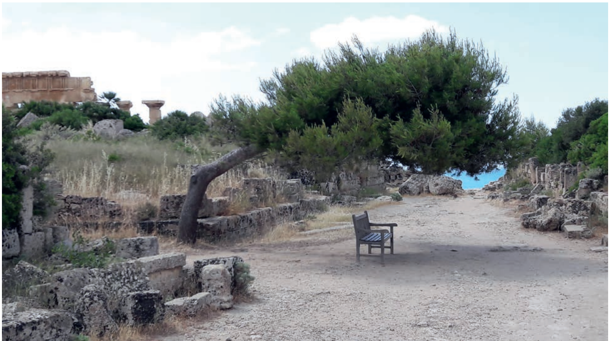
Figure 1.1. A street in the ancient Greek city of Selinus (Selinunte) on the southwest coast of Sicily, showing the linear alignment of buildings and walls, facing south.

More recently, urban planners seeking recipes to achieve social unity and betterment have reconsidered the cities' built environment as a key determinant. In contrast to the classical approaches to urban planning, Fredrick Law Olmstead's plan for the Riverside suburb of Chicago followed natural contours and deliberately avoided right angles (Beveridge et al. 1998). As the well-known modernist examples of Le Corbusier's Ville Radieuse (The Radiant City; Le Corbusier 1935),