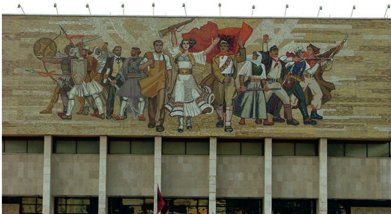
Figure 1.2. Mosaic on the building of the National Museum of History in Tirana, Albania.

Many papers in this volume, however, substantiate the generative force of bottom-up processes in the development of built forms throughout history. Demonstrating the instrumental role of local needs and challenges, a high degree of variability may occur in the layout and organization of nucleated settlements within even the same sociopolitical units. When strong, centralized planning is not implemented, the spatial arrangement and architectural properties of the built environment primarily developed through the interplay of local social dynamics and cultural preferences (Kostof 1991; Sjoberg 1960; Storey 2006).