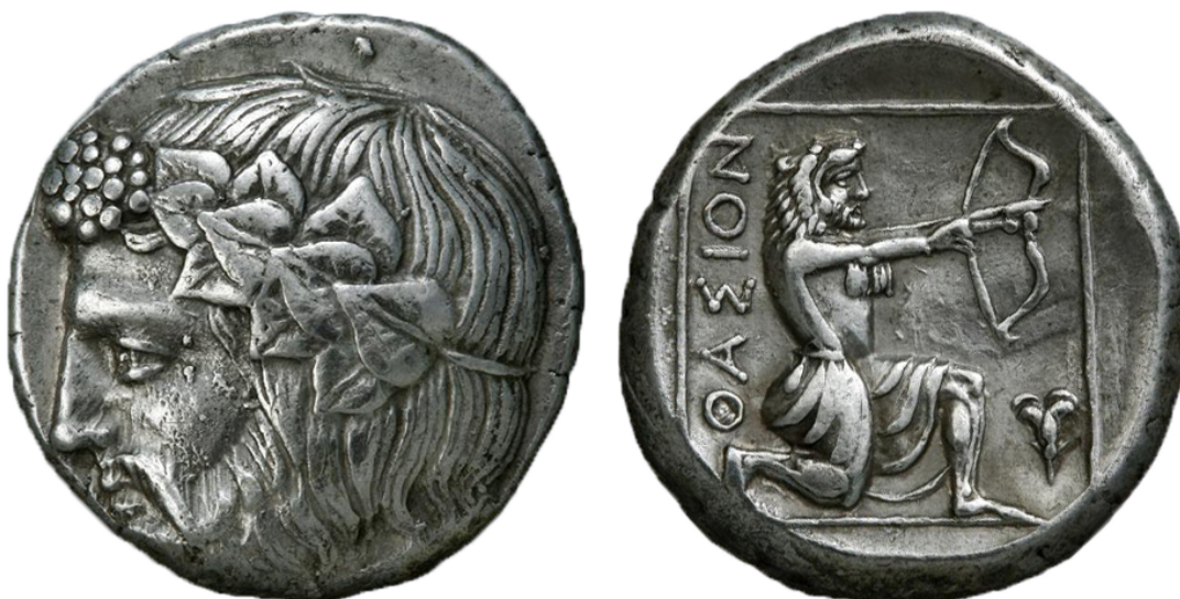
FIGURE 2. SILVER TETRADRACHM OF THASOS. OBVERSE: IVY CROWNED HEAD OF DIONYSUS, FACING LEFT; OBVERSE: ΘΑΣΙΩΝ ( THASION ) [PLURAL GENITIVE FORM OF THASIOS ], RIGHT KNEELING HERAKLES, FACING RIGHT, RIGHT-HANDED SHOOTING ARROW THROUGH RECURVE BOW, WITH ROSE IN FRONT. WEIGHT: 15.21 GR., DIAMETER 24.0 MM, DIE AXIS 330° (COURTESY OF ALPHA BANK, NUMISMATIC COLLECTION, ATHENS).